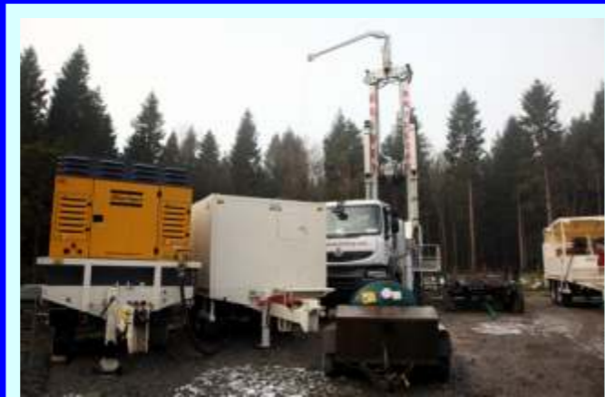
Production Well Drilling at Portlaoise/Mountmellick WSIS